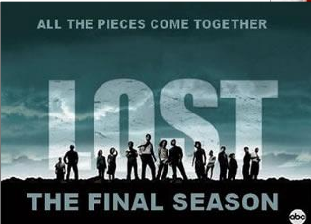
Clockwise: Matthew Fox (Jack Shephard) Daniel Dae Kim (Jin Kwon) Evangeline Lilly (Kate Austen) Jorge Garcia (Hugo 'Hurley' Reyes)