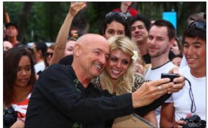
Terry O'Quinn (John Locke)